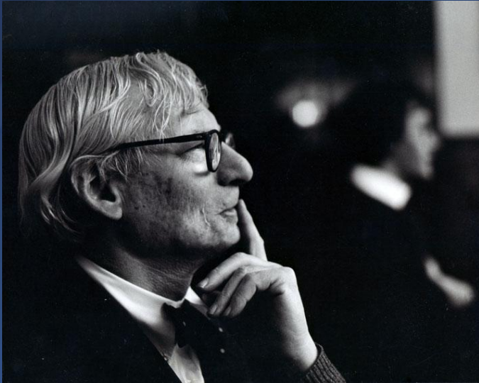
--Louis Kahn, 1901–1974 Pennsylvania Architect